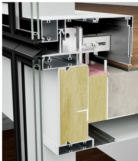
RWW 8000 SERIES SECTION VIEW