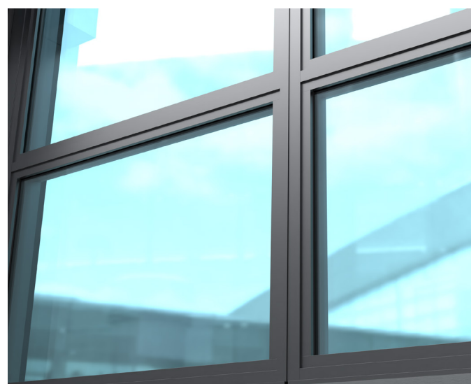
EXTERIOR VIEW RENDERING FOR 170 N. PEORIA, CHICAGO