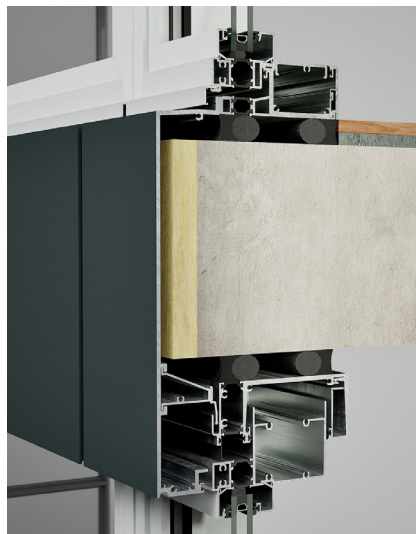
RWW 7000 SERIES SECTION VIEW