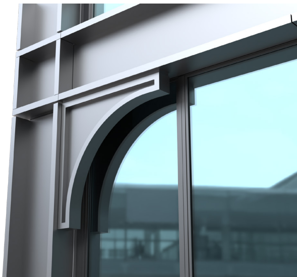
EXTERIOR VIEW RENDERING FOR 170 N. PEORIA, CHICAGO