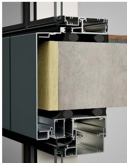
RWW 9000 SERIES SECTION VIEW